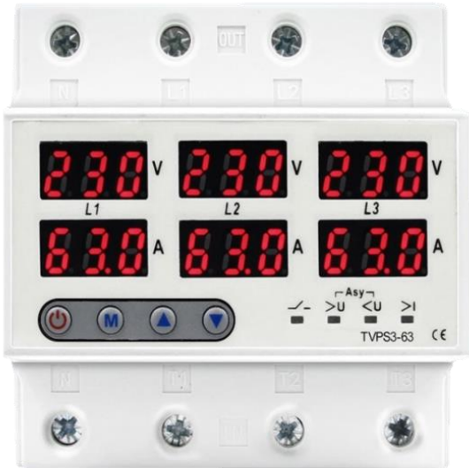
TDP-3 AUTO-RECOVERY VOLTAGE PROTECTION DEVICE 400V 63A 3PHASE SETTABLE