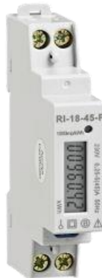
DDS6619 DIGITAL 1P KWH SUB-METER