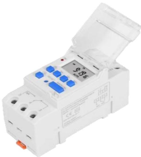
TM919A-2 ELECTRONIC WEEKLY 7 DAYS PROGRAMMABLE 230V 16A