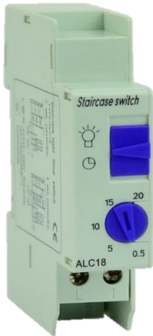
DEX0029 STAIRCASE TIMER LIGHTING CONTROL 230V 0.5s-20mins