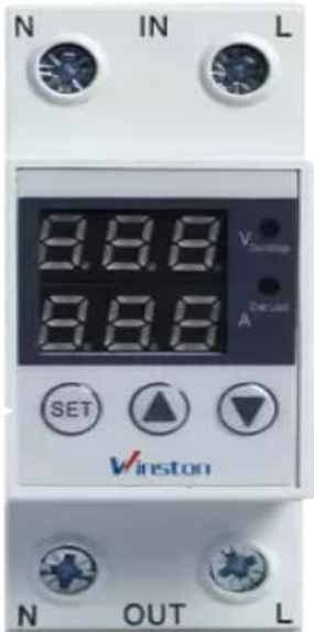
WD-D63 DIGITAL VOLTAGE & CURRENT PROTECTION DEVICE 230V 0V-63A