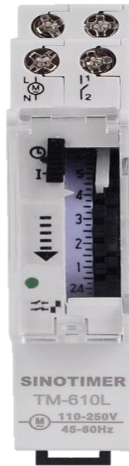
DEX0051 24HR TIMER 1MOD 230V 16A WITH BACK-UP BATTERY 15MINS INTERVAL