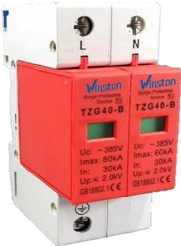
DEX0062 SURGE PROTECTOR 1 PHASE DEX0064 SURGE PROTECTOR 3 PHASE

Winston Surge Protector Device TZG40-B Uc: ~385V Imax: 60kA In: 30kA Up: < 2.0kV GB18802.1 CE